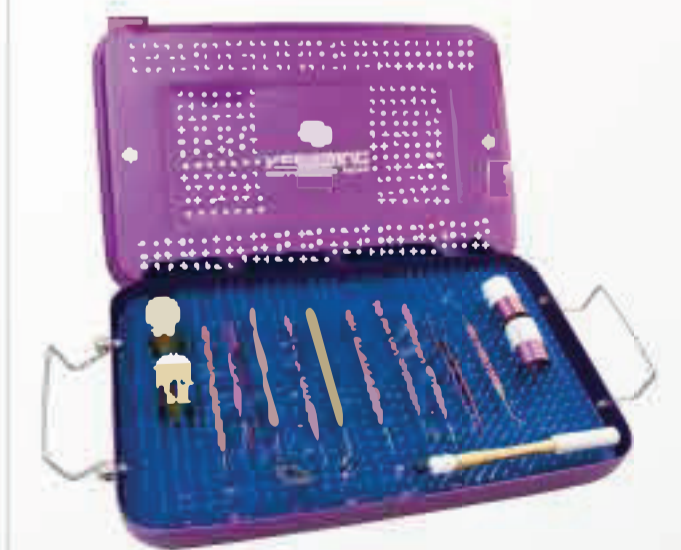
Sterilization Case COD.: KCASE