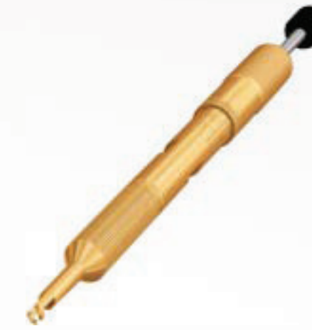
Diamond Knife COD.: KNIFE