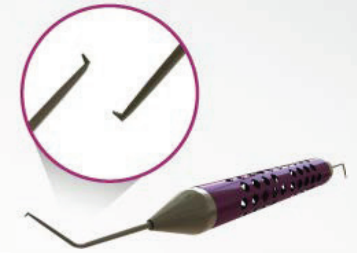
Double Sinskey Hook COD.: OE020