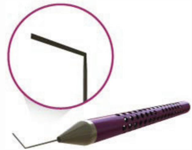
Glider COD.: OE043