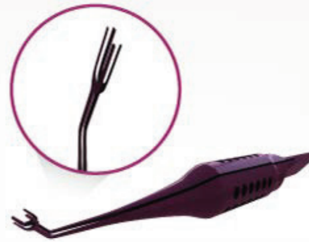
Fixating Forceps COD.: OF030