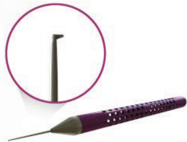
Micro Dissector COD.: OE035