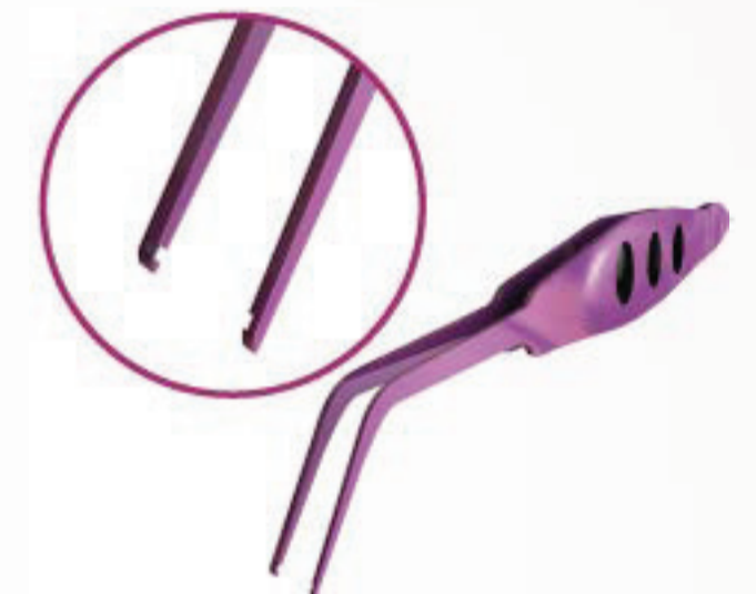
Implantation Forceps COD.: OF174