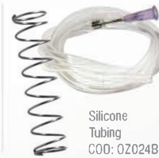
Spring COD.: OZ024A