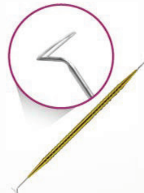
SI6 Dissector COD.: OZ021.01