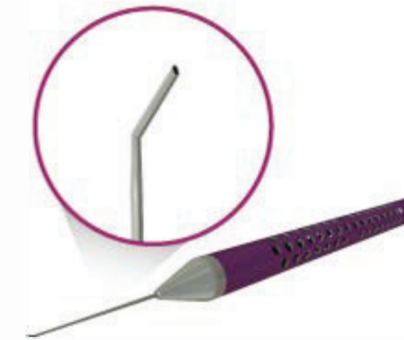
Ring Pusher COD.: OT018