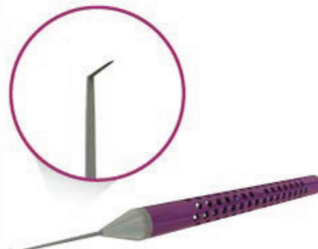
Suarez Spreader COD.: OK025