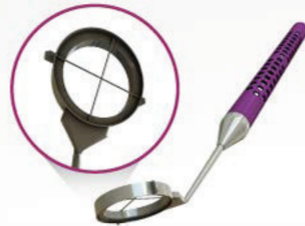
Optical Zone Marker (5mm) COD.: OM014 (6mm) COD.: OM014.02