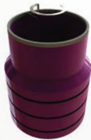
Dissectors (Clock Wise) 5mm COD.: OZ011T . 6mm COD.: OZ011.03