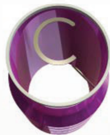
Dissectors (Counter Clock Wise) 5mm COD.: OZ011.01T 6mm COD.: OZ011.04