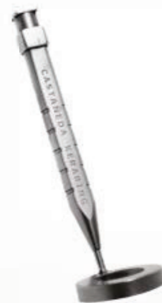
Suction Ring COD.: OZ024