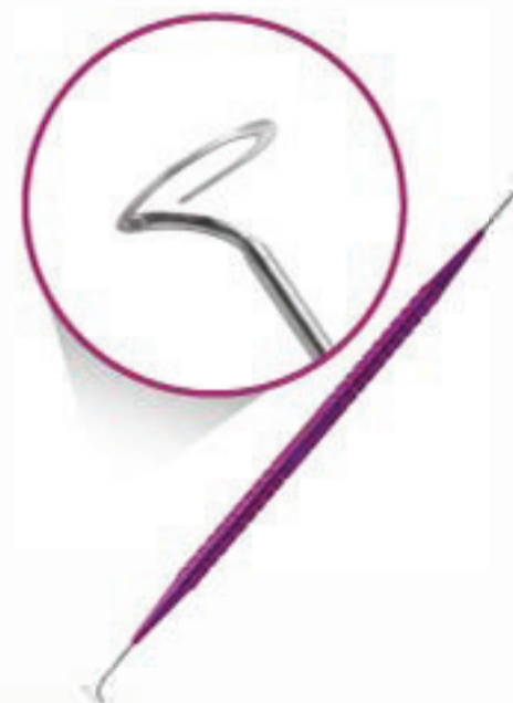
SI5 Dissector COD.: OZ021